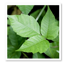
Poison ivy can cause an itchy rash if touched.